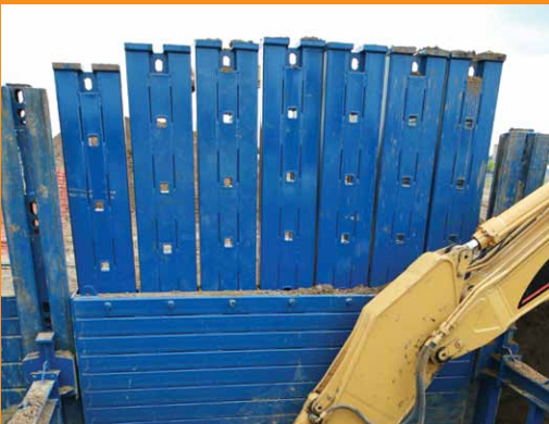
Sheeting guide system